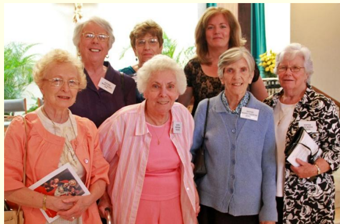
Our Sisters in 2012