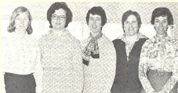
Our Sisters in the 1960's