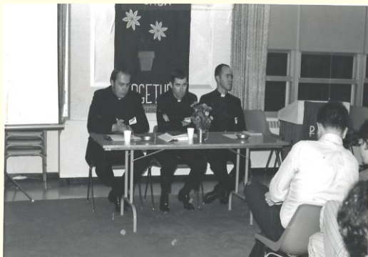
Pastoral Council 1969

Leadership has taken the forms of Parish/Pastoral Council, Trustees and the Finance Committee, clergy, religious and lay ministers.