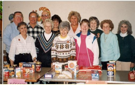
1983 Thanksgiving Drive

Gift cards began to be included in 2004, giving families more freedom in choosing gifts for their children. Seven years ago this ministry also experienced the help of Family Program middle-schoolers to help at Thanksgiving.