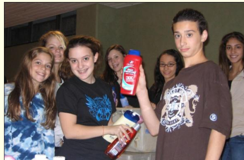
Students from the Family Program assist with the toiletry drive.